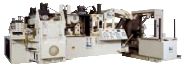
60" x .500" x 40,000 lb. space saving system

One of the first companies to recognize the advantages of the Compact Coil Line was Raybestos Power Train, located in Sullivan, Indiana. Raybestos manufactures clutches and brake disks for most types of vehicles, including the off road super trucks. The critical requirement in the processing of material for Raybestos was equipment that provided ultimate versatility in a limited floor space.