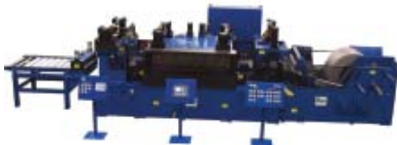
Compact Coil System allows for back load of coils directly into the cradle section

The new system, which was required to handle 40" x .437" x 30,000lbs with a material yield of 60,000psi, was built with a coil cradle entry section designed to payoff the bottom of the coil in place of the older ROWE units which paid material off the top through an overhead loop chute arrangement. This new design allows for a back load of the coils directly into the cradle section of the system. A heavy duty hydraulic debender unit accepts the lead edge of the coil and breaks it for easy thread-up into the straightener/feeder unit.