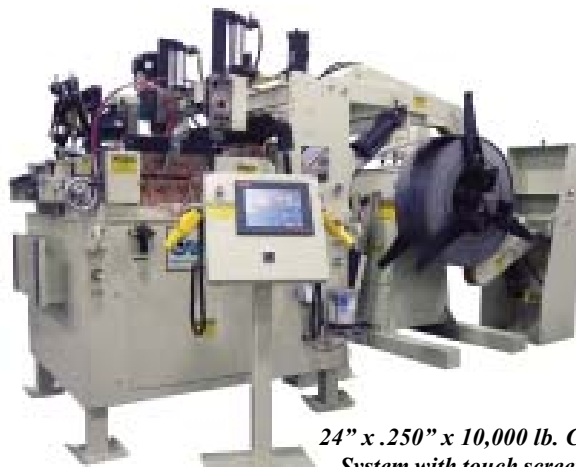
24" x .250" x 10,000 lb. Compact Coil System with touch screen interface

When approached to supply a compact system to handle 24" x .250" x 10,000lbs in an environment which would be processing partial coils CWP supplied a compact system to satisfy the customer requirements. The CWP system utilized a motorized uncoiler with photo eye loop control to allow the slack material to develop directly below the uncoiler spindle. Both primary and secondary hold down arms were provided with powered rider rolls for thread-up and to allow for rewinding the slack material during partial coil operation.