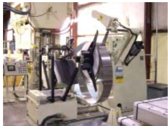
CWP Compact Coil System features ability to payoff the top or bottom of the coil

CWP supplied a compact coil system with a motorized reel, that utilized a dual operation mode to allow the coils to payoff the top or the bottom. The coil car is supplied with power thread-up assist rolls to be utilized when threading up material which will pay off the bottom. This feature allows the lead edge of the strip to be forced straight up into the guide chute on the entry end of the straightener/feeder for hands free thread-up. The straightener/feeder unit is also supplied with pneumatic roll release to allow the upper feed and straightening rolls to open and allow the pilots to register the material into position.