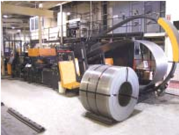
One of the three Compact Coil Systems previously purchased by Blount

be installed in a section of their facility which only had an overhead crane capable of picking the coils 35" off the ground to be loaded into the CTL systems. The system needed to be interfaced with their download communication requirements as well.